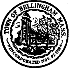
EXHIBIT A Town Meeting Resolution Authorizing Aggregation